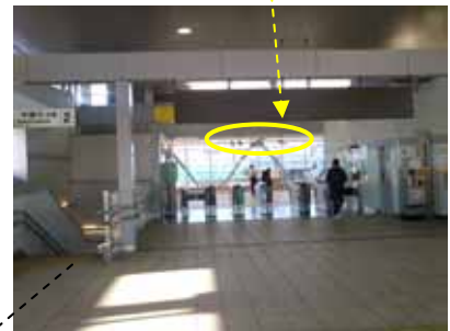
Entrance gate and indication to north exit