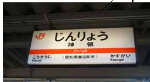
Station name board at platform