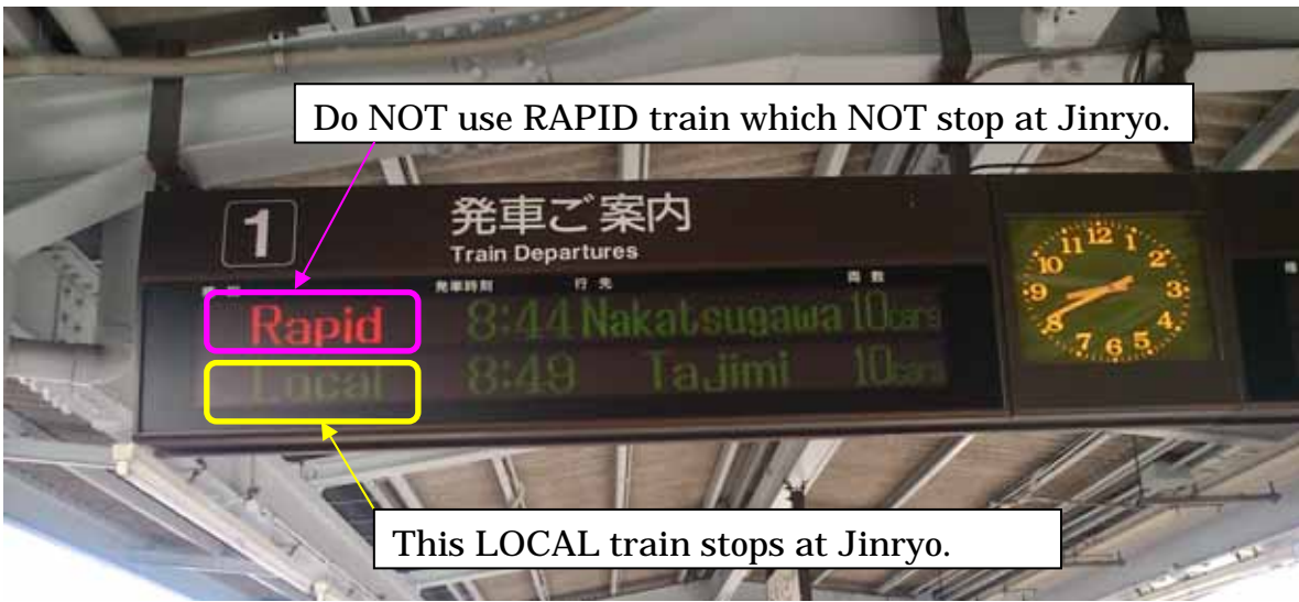
(a) Indication board at platform of JR Chuo line (ex. Chikusa JR station)