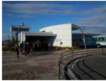
Entrance of school bus terminal