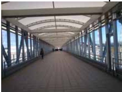
Walkway to north exit